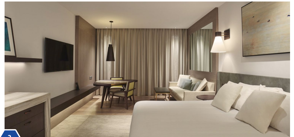
2 Rooms with state of the art audio visual equipment