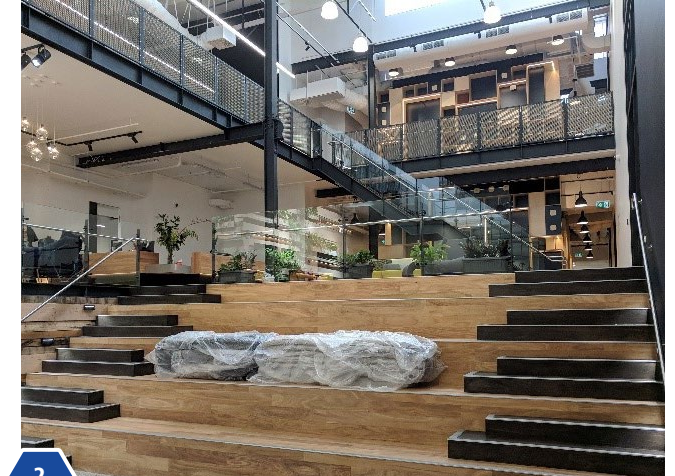
2 Interactive Teaching Space