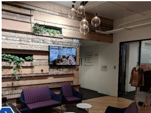
3 Interactive Teaching Space