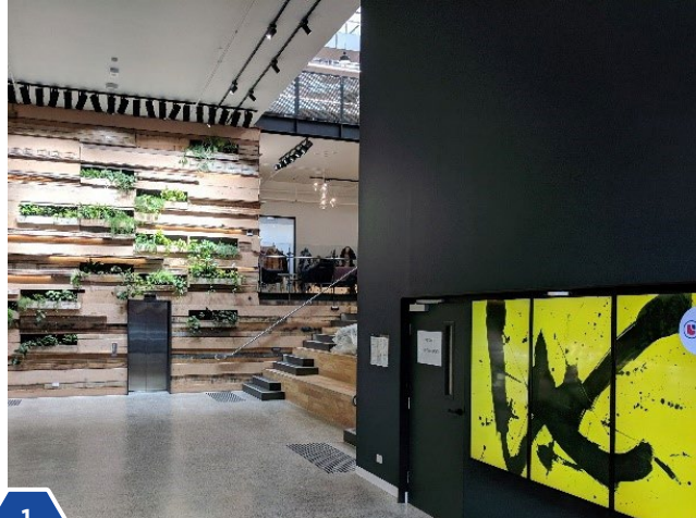
1 Interactive Teaching Space

Digital signage LCD's including a 3x1 video wall were installed to provide advertising and updates for students and staff throughout the campus.